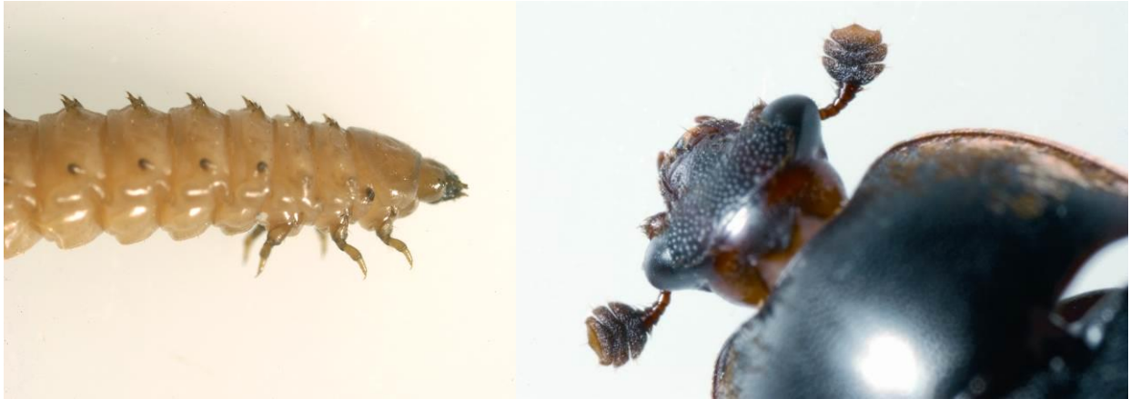
SHB (Aethina Tumida) adult and larval stages

On the 18 th June 2019, the presence of A. tumida (SHB) was again confirmed in eastern Sicily, in an apiary located in the municipality of Lentini in the province of Syracuse. Two adults of SHB were detected in two different colonies, this apiary had been under surveillance since May 2019 as on 2 nd May, the authorities had intercepted a movement of 64 colonies from Sicily without any accompanying documents at the port of Villa San Giovanni on the Italian mainland.