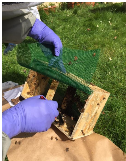
NBU Inspector taking a debris sample from an imported package of bees

It is, of course, illegal to import bees, queens or any bee-related products from within the SHB exclusion zone around the affected areas in southern Italy.