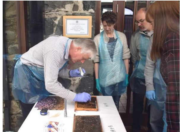
Bee Health Day