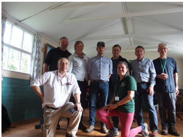
The Tamworth AH nest finding Team