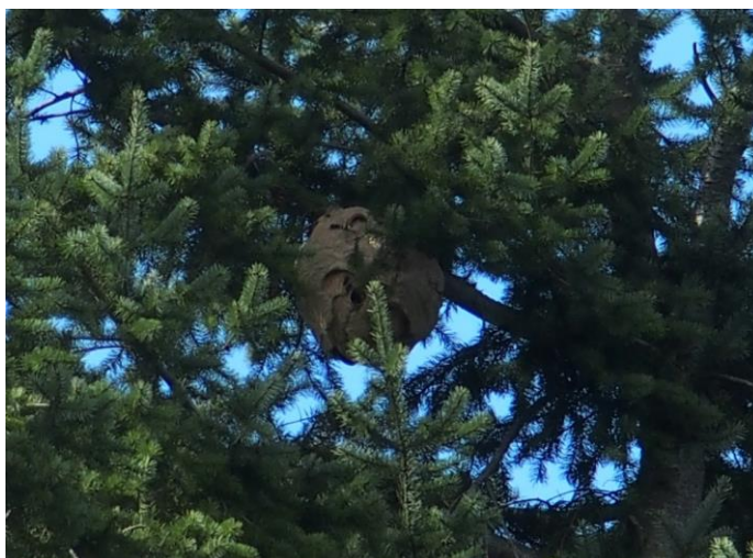
The Tamworth nest, 60foot up – not easy to spot