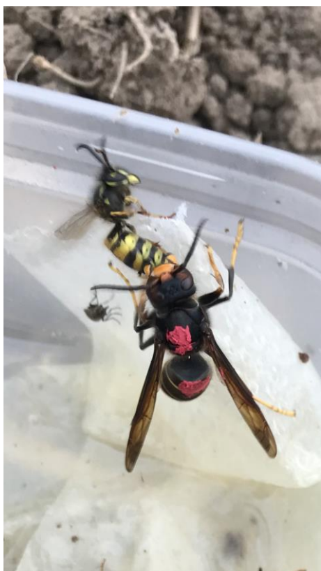
An AH marked for track & trace operations, grabs a wasp at a bait station.