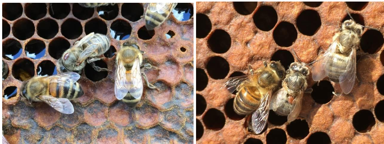
The worst effects of varroa - parasitic mite syndrome (PMS) and deformed wing virus - photos Meg Seymour

http://www.nationalbeeunit.com/index.cfm?pageid=167